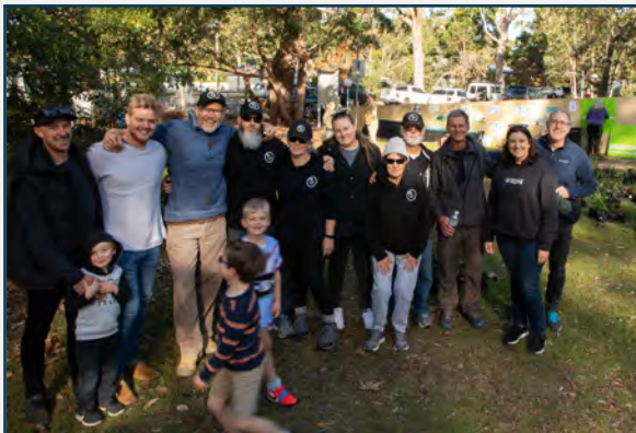
Groundswell Church volunteered their time in letterbox drops, plant pick up days and barbecues for the community