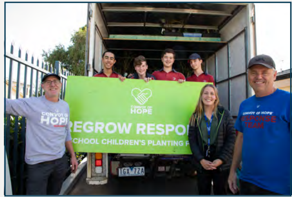
Students from St George Christian School delivering their natives.

St George Christian School St Mary's Star of the Sea Milton Ulladulla Public School Ulladulla High School