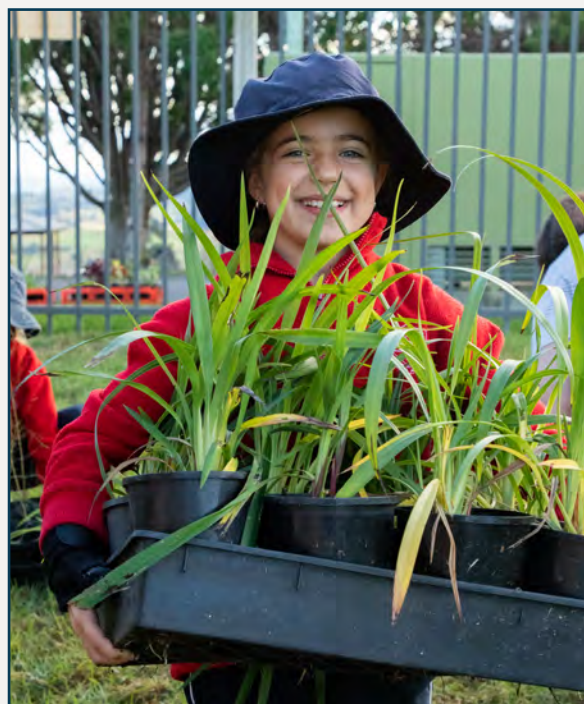
A student at St. Mary's Star of the Sea, Milton helping the Convoy team load the truck.

In June, the Convoy of Hope Team, students, residents, and stakeholders came together at the Lake Conjola Community Centre for a special presentation. Students and residents shared what the project has meant to them, a local student from Ulladulla High School gave a moving didgeridoo performance and a ceremonial planting took place. The atmosphere was heartfelt.