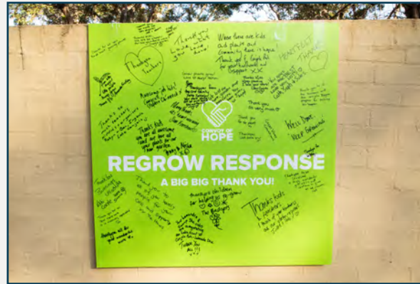
Special words of gratitude from residents and volunteers.