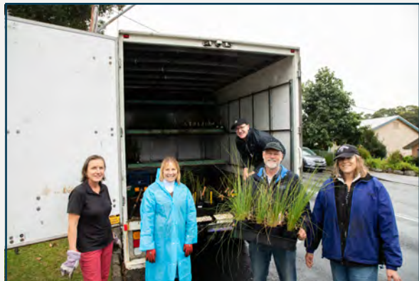
This response would not be possible without all of the volunteers, teachers and stakeholders who got involved!

Don't forget to share your story using the #RegrowResponse hashtag and tag us on social media @convoyofhopeau