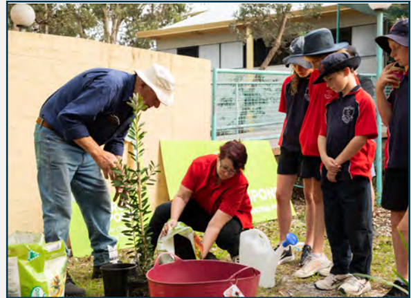
Students from local schools participating in the ceremonial planting at Lake Conjola