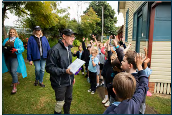
Ulladulla Public School enthusiastically sending off the plants they cared for.