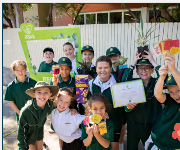
Students at Claremont College spreading hope.